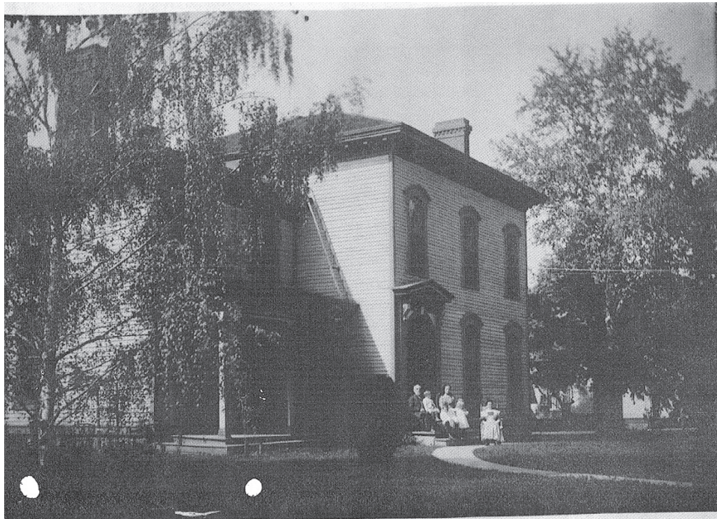
This photo of the former "Kelsey Hotel" dates back into the 1800s.

The golden age of historical Lewiston came alive from the early-1820s to the late-1830s, when travel through Lewiston was required to get further into the states without hassle. During this period of time, the Kelsey Tavern, on 625 Center St., flourished.